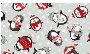
9331F-91 Penguin Toss Cloud