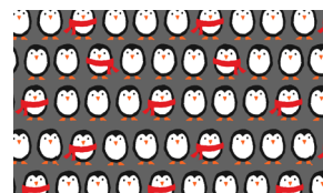
9334F-93 Mini Penguins Storm

**This rag quilt does not have a traditional backing or binding. Back is pieced from the same fabrics as the front**