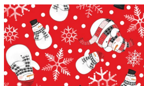
9330F-85 Snowman Toss Red

All fabric quantities are based on 15yd bolts unless otherwise indicated.