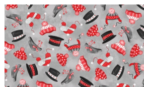
9333F-93 Hat Toss Storm