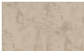
8278-47 Surface Design Nut