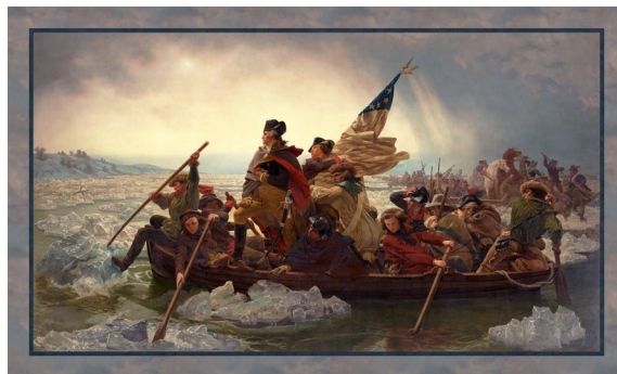
9371P-103 X-Large Painting Panel Patriotic