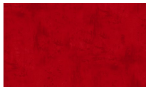
8278-76 Surface Design Scarlet