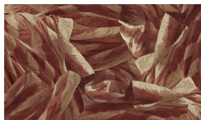
9369-81 Rumpled Stripes Pomegranite