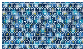
8969-77 Dreidals Geo Royal