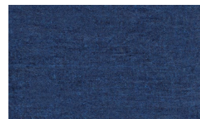
Ink-45 Peppered Cottons Ink

**This projects does not have binding.**