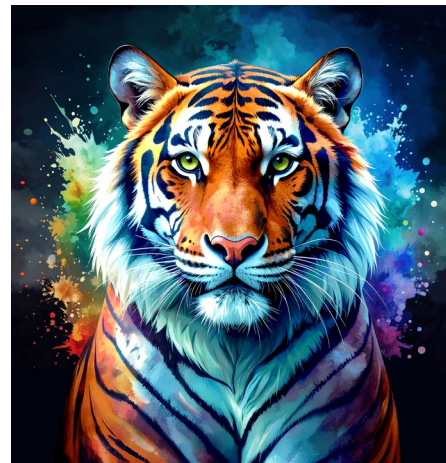
9434P-104 Eye of the Tiger Panel Multi