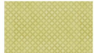
9215-61* Teeny Orange Peel Lime