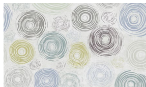
9217-11 Rake Circles Pearl