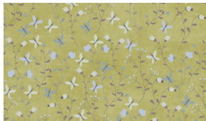
9210-63 Whimsy Floral Lime

All fabric quantities are based on 15yd bolts unless otherwise indicated.