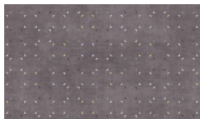
9216-38 Corners Mocha