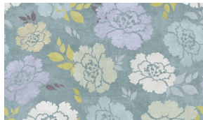
9211-79 Flower Stencils Slate