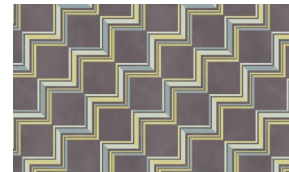
9214-38 Zig Zag Mocha