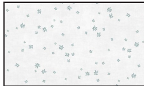
9213-11 Teeny Flowers Pearl