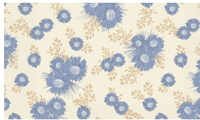
9530-14 Stardust Floral Cream