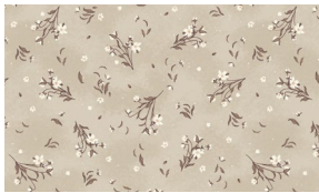
9529-101 Ditzy Floral Neutral