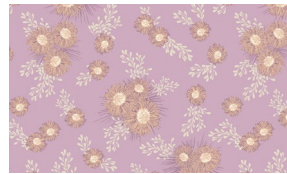
9530-27* Stardust Floral Ultra