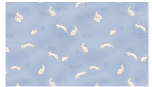
9534-72 Hopping Bunnies Sky Blue