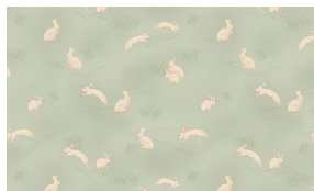
9534-78 Hopping Bunnies Sage