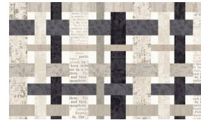
9401-10 Wordy Plaid Charcoal/Off White