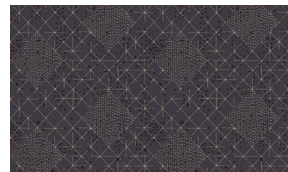
9407-97 Geo Texture Dark Charcoal