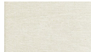
Oyster-35 Peppered Cottons Oyster