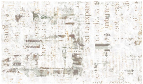
9399-14 Mixed Media Texture Off White

All fabric quantities are based on 15yd bolts unless otherwise indicated.