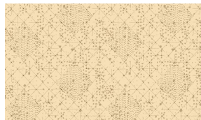
9407-41 Geo Texture Naples Yellow