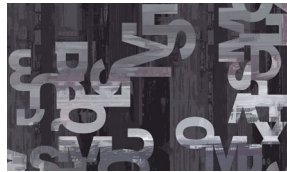
9400-89 Brushstroke Alphabet Eggplant