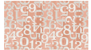
9402-22 Numbers Dusty Coral