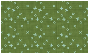
9513-61 Criss Cross Applesauce Pistachio