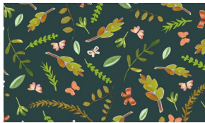
9512-69 Scattered Leaves Dark Green

All fabric quantities are based on 15yd bolts unless otherwise indicated.