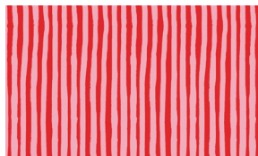
9517-28 Painted Stripe Candy Cane Red