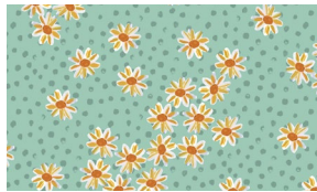
9514-16 Daisies Seafoam